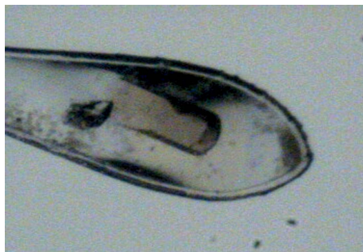
Figure 2 Crystal of PfGAK . Crystals typically grew to maximum dimensions of 0.3 × 0.1 × 0.1 mm.